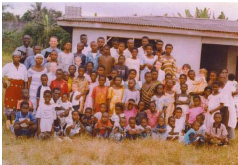
Congregation of Aiyinasi Independent Baptist Church