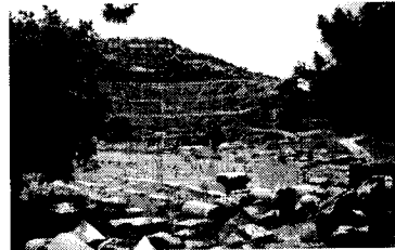
Theatre of Ephesus