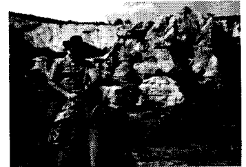
Riding a camel in Cappadocia