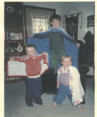
3 Super Heroes