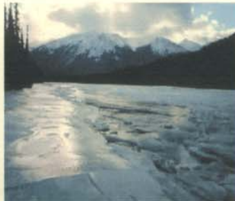
Frozen River & Canadian Rockies