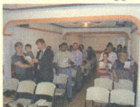
Iglesia Baustia de la Biblia Abierta (Open Bible Baptist Church)

He who has the biggest truck, goes first at an intersection.