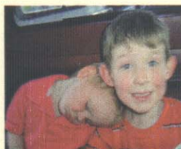
I wish I could sleep like that.