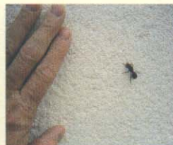
A Mexican ant!